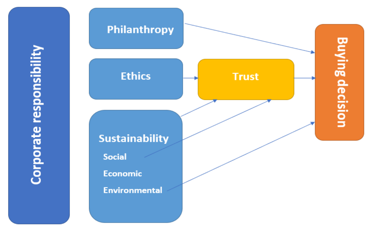
Figure 2 - Model to test

are under 18 years old, 15.70% are 18-24, 37.50% are 25-34 and 31.30% are 35-44 years old, other 14.90% are over 45 years old. When asked about employment status, the data show that 75.20% of the respondents are employed and other 24.80% unemployed. The question about number of household members received following answers; 69.20% of the respondents live in a household with 1-2 members, 19.00% live with 3-4 people in a household and 11.80% with 5 or more household members. Also, one of the demographic information gathered is about the total monthly income in the household and the answers are following; up to 500 BAM or 255,6 € have 2.50%, 500 to 1000 BAM or 255,6 up to 511,30 € have 16%, 1000 to 2000 BAM or 511,30 to 1022,60 € have 38.90%, 2000 to 3000 BAM or 1022,60 to 1534,00 € have 25.50% of the respondents, only 17% of the respondents have a total household income over 3000 BAM or 1534,00 €. When analyzing the importance and effects of CSR activities on customers buying decisions, the questions were designed to cover each of the CSR dimensions including philanthropy, ethics, and sustainability which further incorporates the social, economic and environmental elements, as seen on the fig. 2 below.