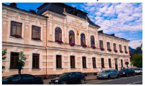
"Bogdan Vodă" Gymnasium School

school's establishment, the language of instruction was German, and Romanian much later. The school has been proud since the inception of its existence with exceptional teachers and students capable of performing. Due to the numerous extraordinary results at the Olympics and competitions, the school has stood out and stands out as a benchmark of Suceava County.