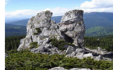
"Pietrele Doamnei" Nature Reserve

The gorges are located at the northeastern foot of Rarău, 10.5 km from the city center. The view is wonderful due to the vertically rising walls. The gorges are home to species of yew and glacial relic. The pride of the place is also due to the rare species of animals and plants such as: lynx, fox, marten, corner flower and bells.