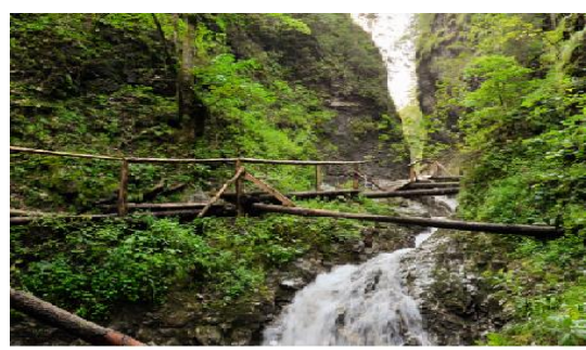
"Cheile Moara Dracului" Reserve

The Rarău Massif. One of the most famous tourist attractions in Romania, the Rarău Massif offers a magical landscape to those who visit it, the wonders of the place causing those who arrive for the first time to return. The spectacularity is given by the strange rock-shaped formations and the numerous panoramic views.