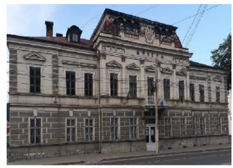
"Peasant Art of Wood" Museum

"Wood Art" Museum. Located in the central area of the Municipality, the museum is a true masterpiece of Romanian culture from the eighteenth and nineteenth centuries. Sheltered in a building, an architectural monument, built around 1900, the Museum of "Wood Art" surprises with its unparalleled values, with the uniqueness of some pieces, revealing the mastery of folk craftsmen. The museum's collections are arranged on occupations and crafts on an area of 1822 square meters, in 26 exhibition halls. The museum includes a collection of specialized ethnography, which presents wooden objects existing in the Communes of Bucovina (Obcina Mare, Obcina Feredeului and Obcina Mestecăniș).