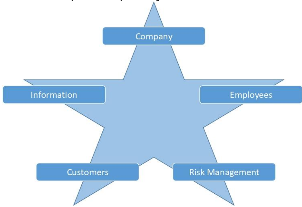
Figure 3 - Digital transformation strategy star

Figure 3 aims to isolate and combine the most imminent elements of digital strategy formulation, in order to structure the discourse on the topic with the help of an integrated framework: